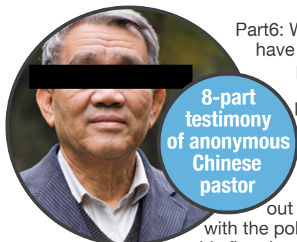
8-part testimony of anonymous Chinese pastor

Biblical Truth: Everyone is born a sinner and is a product of our sinful father, Adam. Once we are born again, we are born of God and become like Christ.